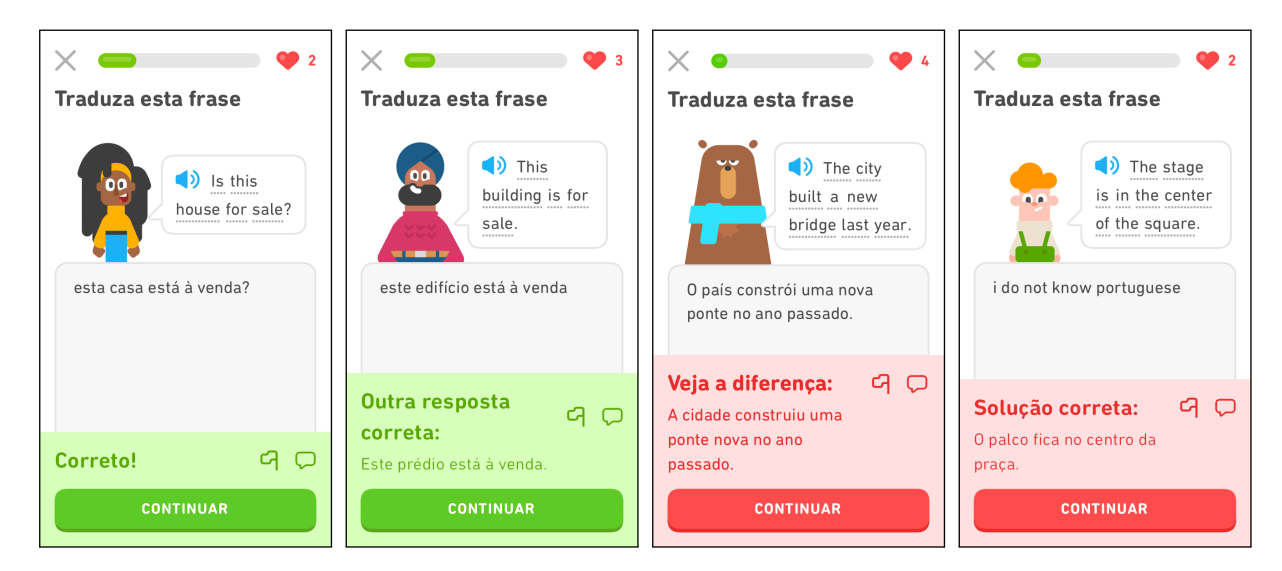
Figure 1: Screenshots from the Duolingo app (iOS, circa 2020), showing translation exercises for English prompts into Portuguese. The first two examples show correct student translations, with Duolingo suggesting an alternate, preferred translation in the second case. The third and fourth responses show incorrect translations.

field-tested accepted translations , each weighted and ranked according to their empirical frequency among Duolingo learners. We also provide a high-quality automatic reference translation of each prompt that may (optionally) be used as a reference or anchor point, in the event that researchers want to explore paraphrase-only approaches (this also serves as a strong baseline). See Table 1 for an example from the Portuguese dataset.